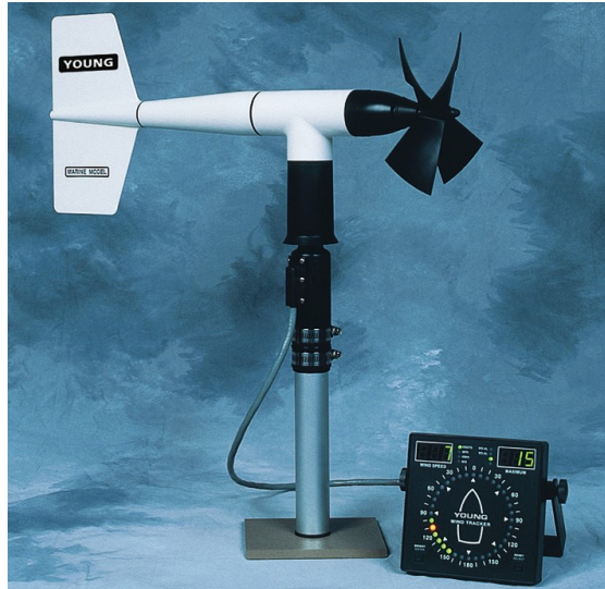
Wind Tracker pictured with Wind Monitor – MA

4-20 mA inputs, Serial NMEA, and Voltage outputs are standard on the Marine Wind Tracker. Alarms for both wind speed and wind direction are included.